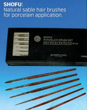
SHOFU: Natural sable hair brushes for porcelain application.