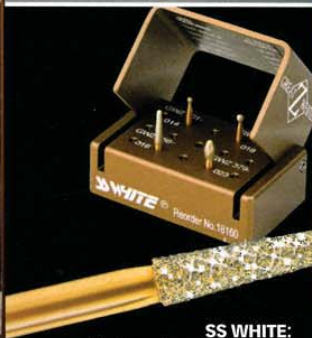
SS WHITE: Work on zirconia with Great White Z Cuts diamonds.