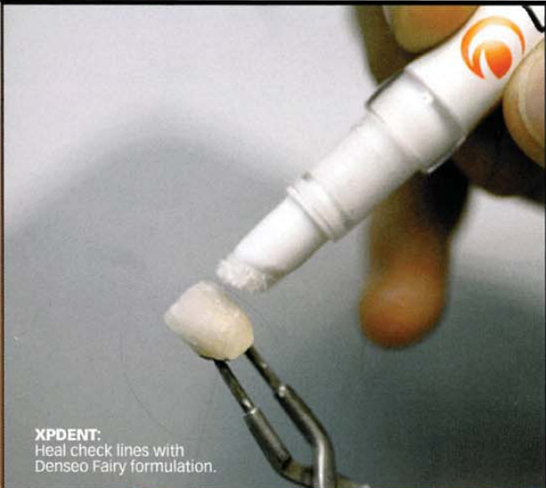
XPDENT: Heal check lines with Denseo Fairy formulation.